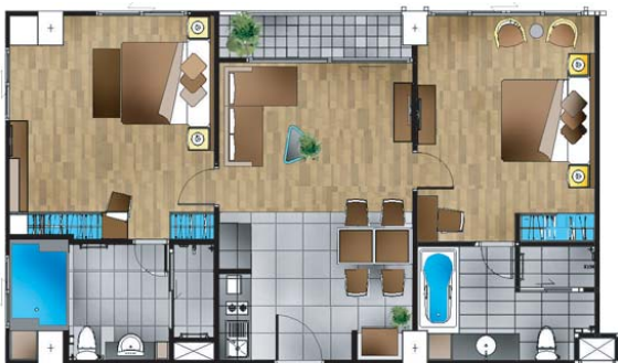
TWO BEDROOM 100 Sq.m.

TWO- BEDROOM SUITE - 100 Sq.m. with king bed. Furnished Two Bedroom with living room, air conditioning, balcony, hairdryer, kitchenette, refrigerator, laundry machine, cable TV, 2 separate shower room, jacuzzi in master bedroom, ADSL boardband internet, and 32" LCD TV. Non-smoking room (on request). Maximum occupied for 5 persons.