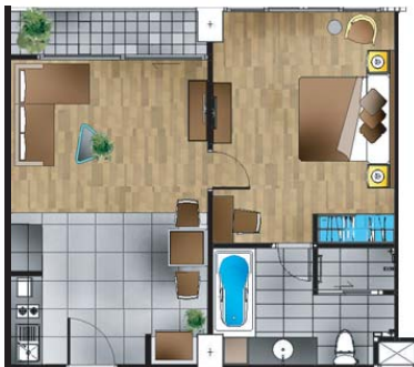
ONE BEDROOM 50-70 Sq.m.

ONE- BEDROOM - 50-70 Sq.m. with 1 king bed. Furnished One Bedroom with living room, air conditioning, balcony, hairdryer, kitchenette, refrigerator, laundry machine, cable TV, separate rain shower and bathtub, ADSL boardband internet, and 32" LCD TV with DVD player. Non-smoking room (on request). Maximum occupied for 3 persons